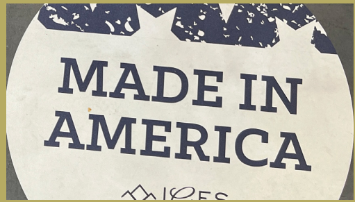
Made in America Pavilion