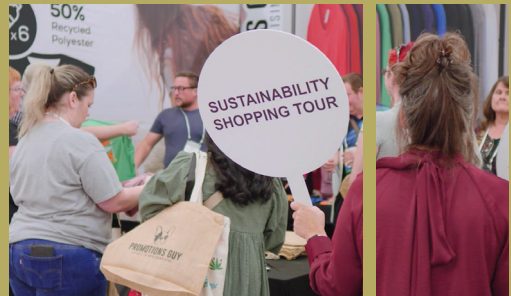
On-Site Shopping Tours