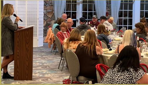
Buyer Dinners: Amusement Park & Waterpark, Campground + National & State Parks, Caves, Museum