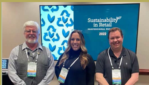
Sustainability in Retail Professional Program