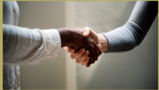
Industry Association Annual Meetings ZAG (Zoo, Aquarium & Garden Group)