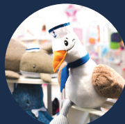
Toys, Games & Puzzles