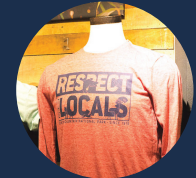
Apparel (Imprinted Softwear/T-shirts)