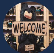
Made in the USA