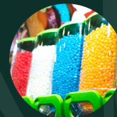
Gourmet, Confections, Specialty Foods