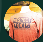
Apparel (Imprinted Software/T-shirts)