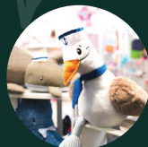
Toys, Games & Puzzles