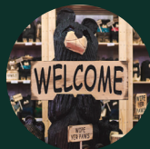
Made in the USA