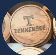
Souvenirs & Novelties