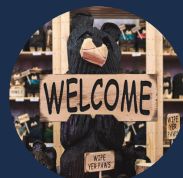
Made in the USA