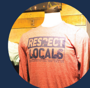
Apparel (Imprinted Softwear/T-shirts)